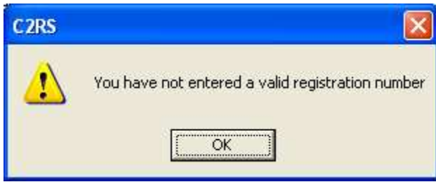
Figure 7. Incorrect Registration number.